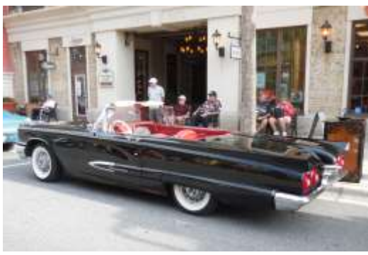
[see more MEMBER NEWS, page 4]