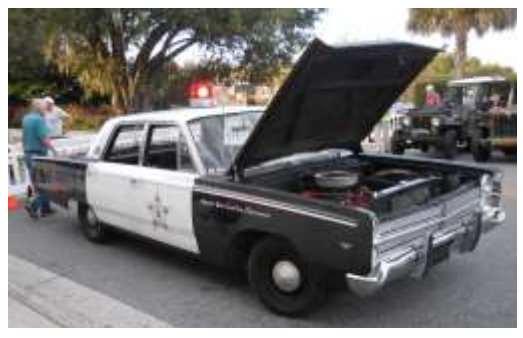
[Editor: more of Jim Colville's great photos from The Villages next month]