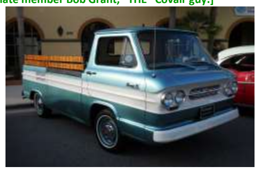
The 60's and 70's are my favorite eras.