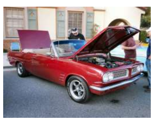
Some of the Firebirds and Camaros.