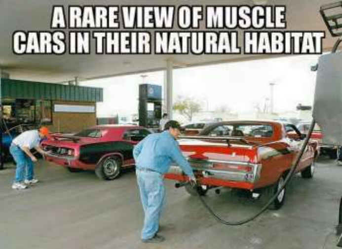
[Shhhh, be verrry, verrry, quiet - don't startle 'em!]

Send news, articles, and ads to: shenandoahregion@gmail.com