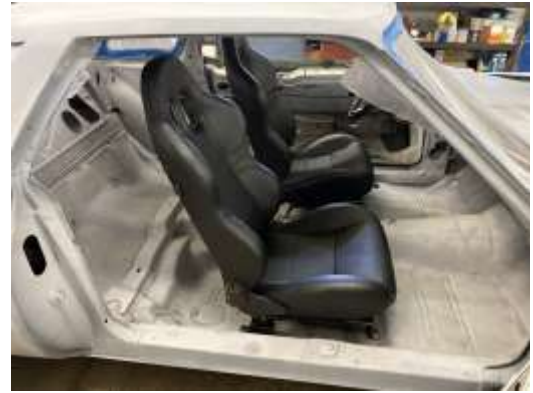
[Editor: WOW, Mark, you are meticulous. Great attention to detail and documentation. See more MEMBER NEWS, page 7]

About two months ago I got a pair of new racing seats. I fabricated new brackets to fit them to the original seat sliders, painted them and trial fitted them in the car. I needed to do this prior to painting the interior. After installing them I was able to locate the correct mounting location for the shoulder belt crossbar.