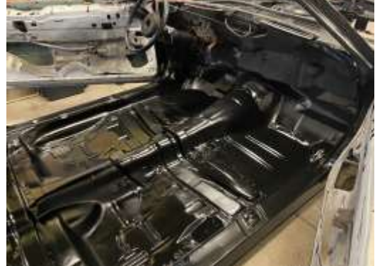
[continued in MEMBER NEWS, page 4]