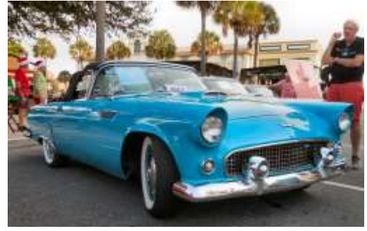
Plenty of 30's cars at The Villages too.