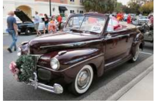
And 40s cars, as well.