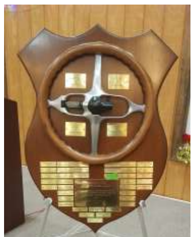
Before the "Big Reveal". Note the green tape.

In 1983, this award was created to honor, and thank members who went above and beyond, to "steer the club in the right