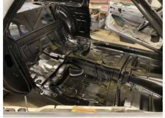
first two photos show the results after this step.

During a nice warm day in Nov., I pushed the car out in the yard and painted the interior satin black. The