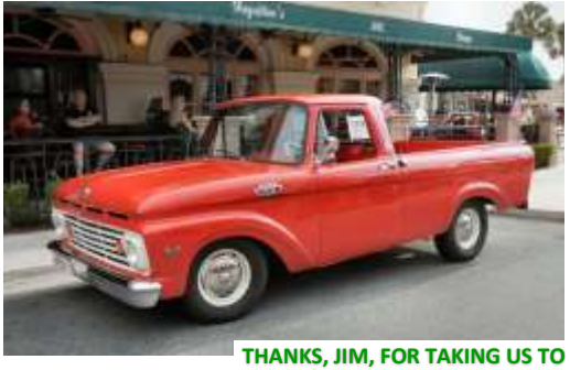
FLORIDA WITH YOUR CAMERA!