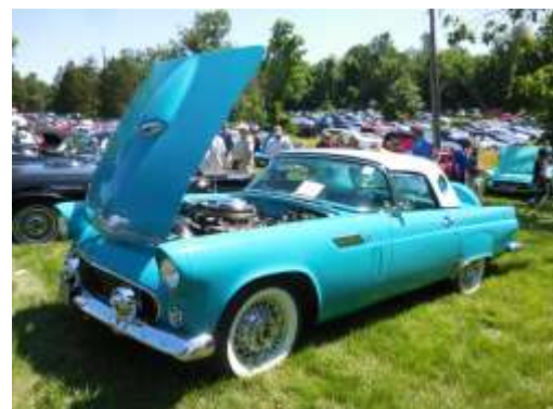
[see more MEMBER NEWS, page 13]