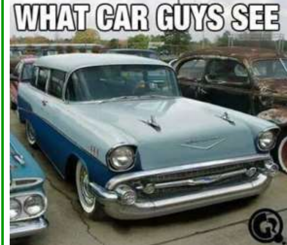
[Yeah, those car guys have big imaginations..... but maybe not the bank accounts to match 'em...]

> Continue on Route 803 until it curves uphill, meeting Rt. 50. > Turn right onto Route 50, driving east.