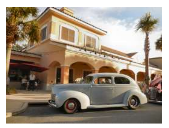
[see more MEMBER NEWS, page 7]