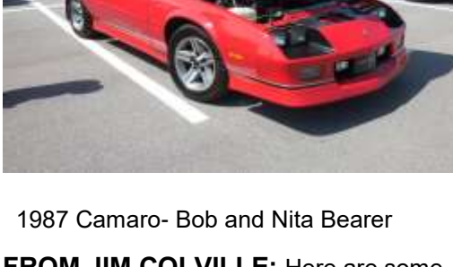
FROM JIM COLVILLE: Here are some additional photos from the CCHS April 24 show in Berryville.