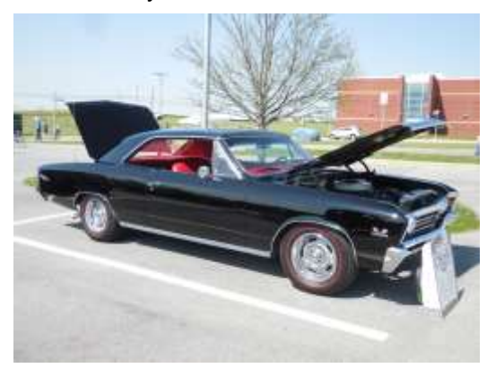
[see more MEMBER NEWS, page 7]