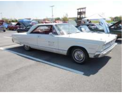
1966 Plymouth Sport Fury- Jim Colville