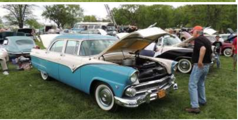
A Couple of Blasts from the Past! Apple Blossom Show Field Scenes 2014 and 2017