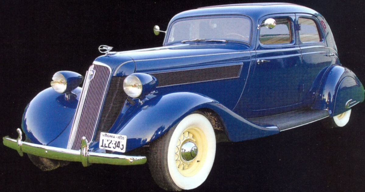
1935 Studebaker Commander Land Cruiser