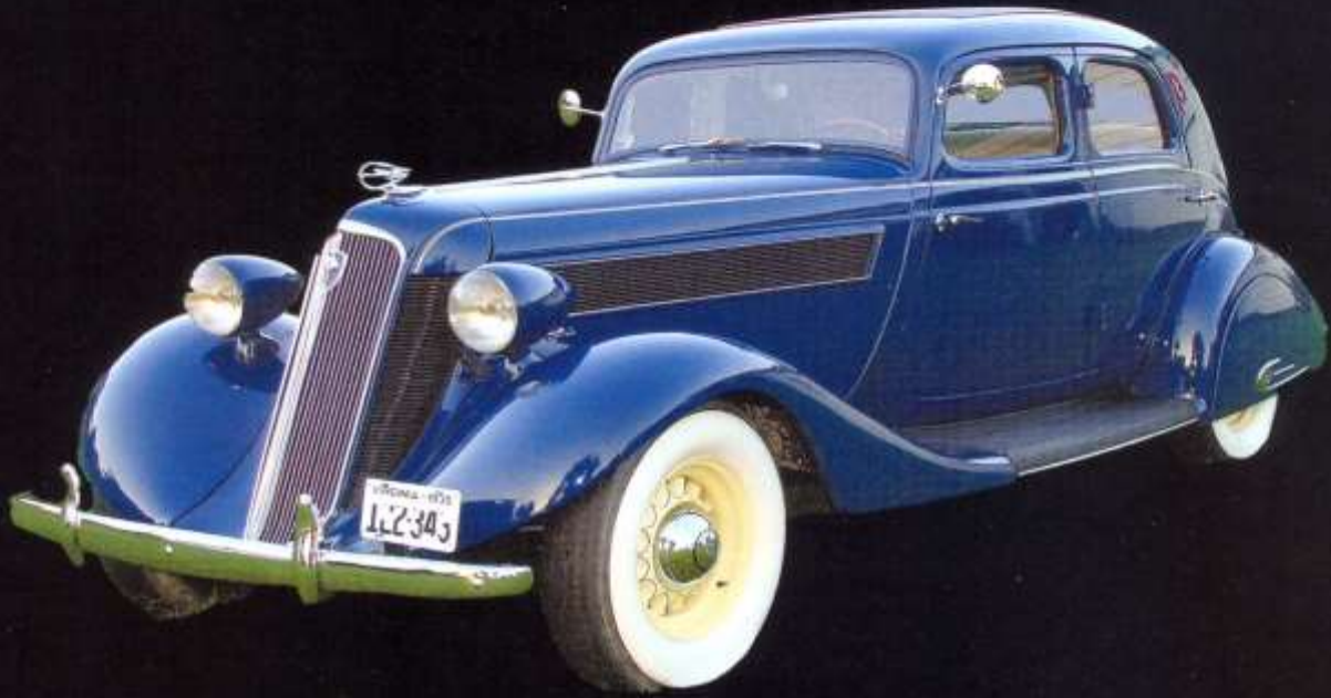
1935 Studebaker Commander Land Cruiser