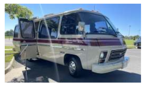
[More MEMBER NEWS, page 12]

up to walk through and take a look inside.