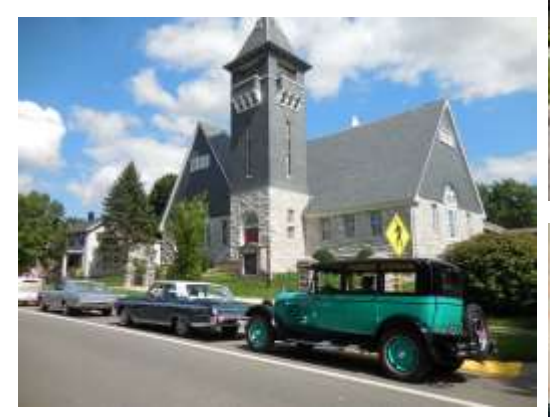
faces, and the weather couldn't have been better. Here are a few shots from the show. The International Scout II looked like it was built for off-roading but was way too nice to actually take off road. The Nova SS 396 was nice,

I attended the Middletown car show on August 20 with a few buddies. We saw some familiar cars and some familiar