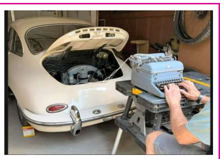
[Rare photo of an early engine diagnostic tool ....]

NOTE: STARTING IN OCTOBER OUR MEMBERSHIP MEETINGS WILL BE INDOORS AGAIN. SEE PAGE 5 FOR MORE INFO.