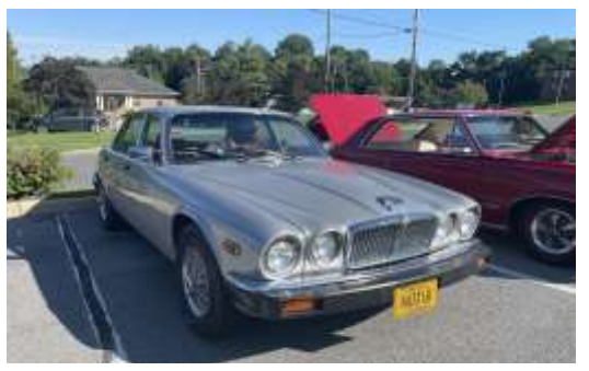
[More MEMBER NEWS, page 5]