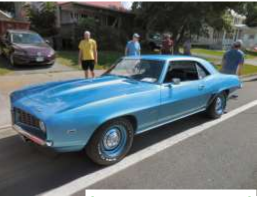
[More MEMBER NEWS, page 13]