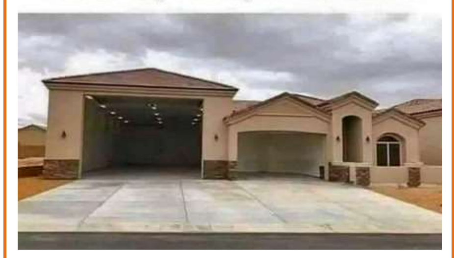
[Every Car Guy's Dream House - don't try to deny it ....]