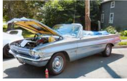
Bradley Grubb's 63 Falcon, a 65 Ford pickup, and of course what cruise in would be complete without a 57 Chevy (or several 57 Chevys).

First, a 62 Olds F-85 Cutlass with the 'Jetfire" Turbo.