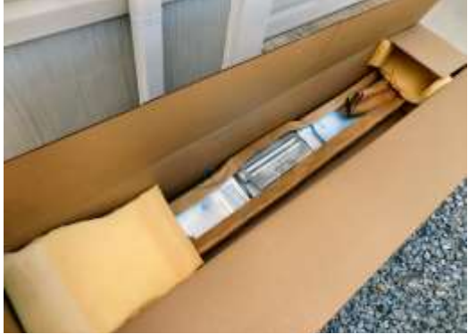
[Editor: bumper seems very well packaged for protection]

Well, it's been about six weeks. Tuesday they called me to let me know the bumper was ready. They needed my credit card info and my shipping address and said it would ship out that day. That was Tuesday around lunch time. Late Wednesday morning I ventured out to my garage and found this sitting by the garage door. Wow! that was fast! I know I'm about a twelve hour drive from their place in Tennessee.