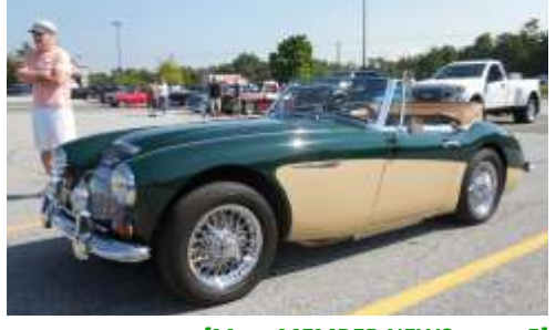
[More MEMBER NEWS, page 5]