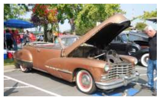
[Continued under MEMBER NEWS, page 11]