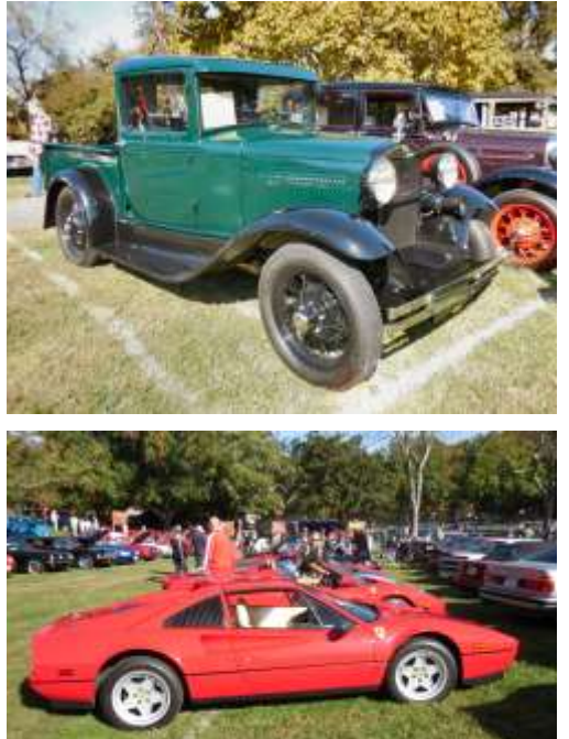
[Editor: Jim submitted over 125 photos of the Rockville Show. More will be included in the newsletter issues to come. THANKS, JIM, FOR ALL YOUR WORK!]