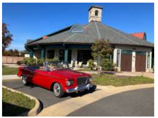
FROM JIM COLVILLE: I attended the annual Tri-State Truck Show in Clearbrook along with some friends on Friday 9/23. There are always some interesting vintage trucks in attendance. There were several Studebaker trucks, including a trio of early 60's pickups.