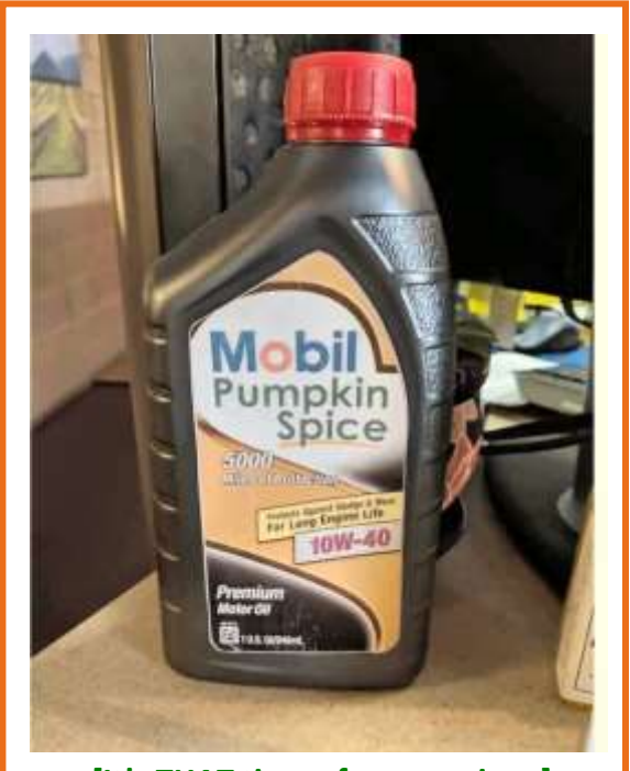
[It's THAT time of year again....]