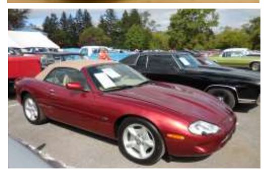
The 69-70 Pontiac Grand Prix was a nice car [top center] but I have never seen one in that shade of green.