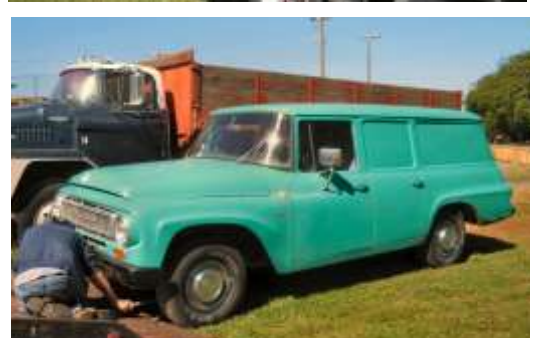
[More MEMBER NEWS, page 10]