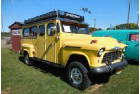
There were several Chevy pickups in the

show. This 72 was a nice example. The early Mack dump truck we estimated to be from the teens based on the open cab and brass hardware in the cab.