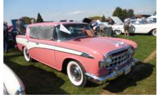
[More MEMBER NEWS, page 11]

A right-hand drive Toyota that looked like a cross between a Chrysler Airflow and a Chrysler PT Cruiser. It was also about halfway between the two cars in size. Next a beautiful full size car, Pontiac 67 Grand Prix convertible, a Lotus in the race car class, and a 1953 Nash Healey.