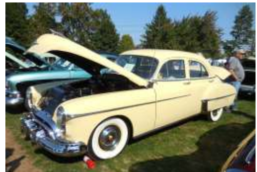
[Editor: more HERSHEY photos in future issues— you've seen only half of what was submitted !]