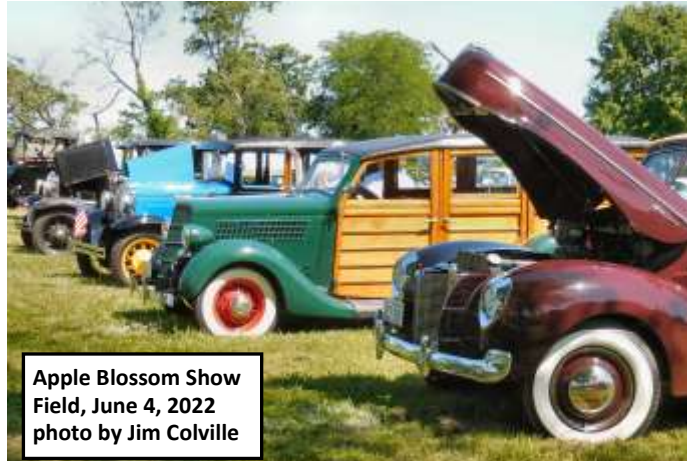
Apple Blossom Show Field, June 4, 2022

Then the special Auction Night meeting was lots of laughs. We found out that members loved delicious baked goods as much as they loved their cars and more than car parts. The car parts and