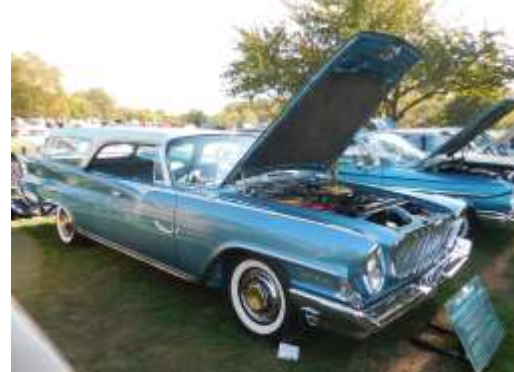
[More MEMBER NEWS, page 12]