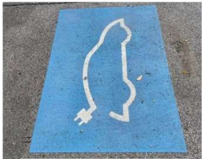
[From the UK Nissan LEAF Owners Group Facebook page]

Struggling to find the EV bays at Morrisons , but I did find bays for plug in cats.