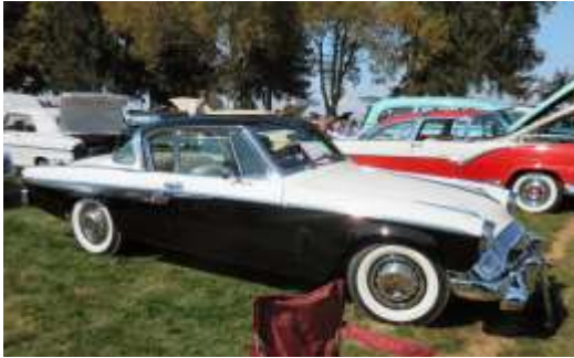
There were several 50's Studebakers in the show including the black and white 55 coupe.

FROM JIM COLVILLE: MORE FROM FALL HERSHEY [Editor: more eye candy from the Oct 2022 Fall National Meet at Hershey showfield]