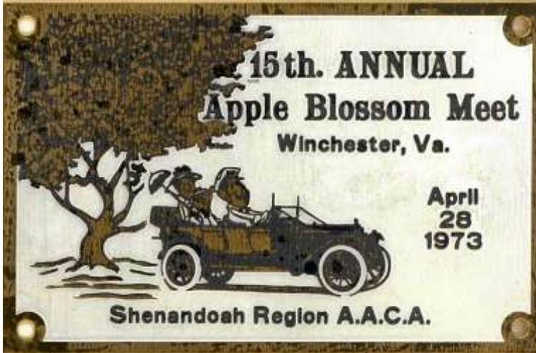
50 YEARS AGO - This was the dash plaque (brass) back when our show was the same weekend as the Festival.

Just imagine this: 375 Production cars from 1930 to 1975, needing judging, and spread over many rows. What's not in this count are the Corvettes, Tri-