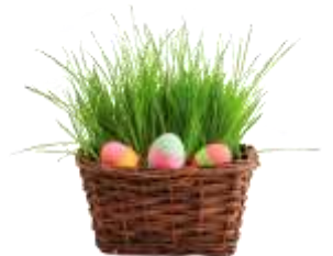
[More MEMBER NEWS, page 11]