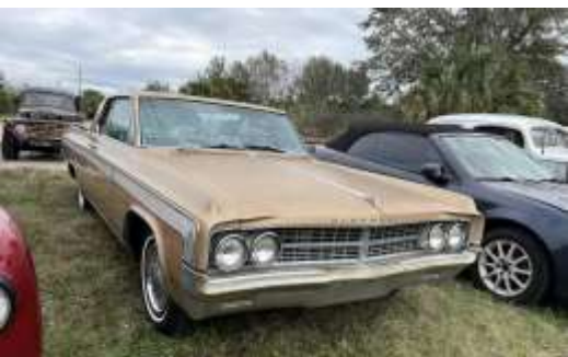
I thought that this 1963 Oldsmobile