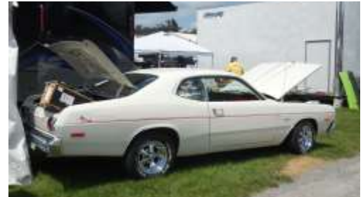
Super Stock engine under the hood, just like the little old lady's car in the