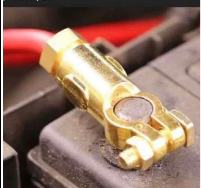
Submitted by David Sunter

So much negativity online, so I figured I'd share a positive post