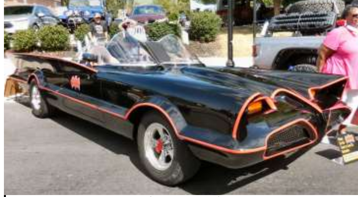
This Batmobile replicar from the 60's TV show was seen at the downtown Charles Town Show Sept. 2 and would be the perfect Halloween ride.