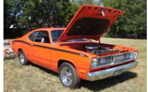
[Continued under MEMBER NEWS, page 8]

PRESIDENT: [from page 1] with a body that could accommodate Samuel Castle's seven-foot tall, 300-pound frame. Bender did a beautiful job of building a tall and lengthened coupe body nestled into the frame,