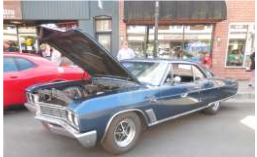
Buick Skylark that was sitting pretty with its 5-spoke chrome Buick rims.