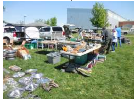
Flea marketeers & their wares