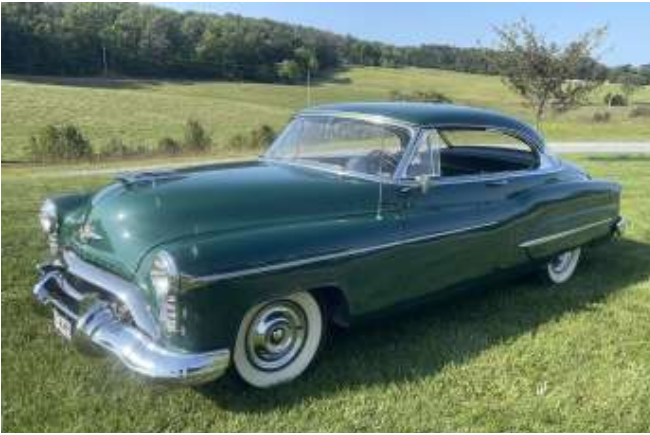
Kevin & Nicole Malony's 1950 Oldsmobile 98 Holiday Coupe by Kevin Malony

Of the 190,000 Olds 98's that were produced in 1950, 8,283 were Holiday Coupes. They were powered by a 303 cubic inch overhead valve V8 that was known as the "Rocket" and was popular for its performance. The Rocket V8 was paired with a "Hydramatic" automatic transmission. It had a six-volt electrical system.