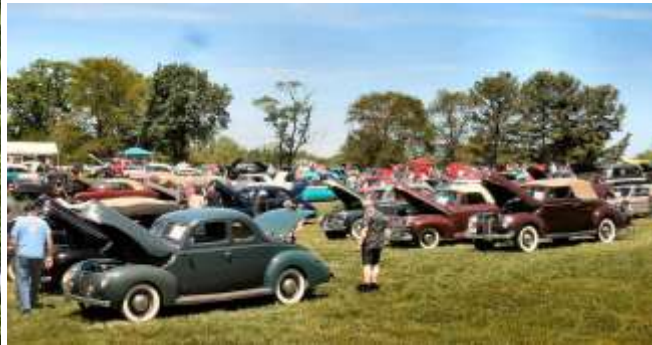
Before & After: (Left) Part of the Field setup team on Friday, and (Right) the Showfield on Saturday. Note the white Administration tent in the background on the left in both photos.