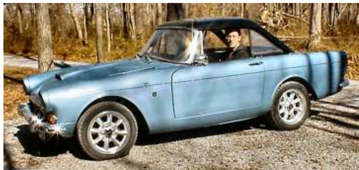
Above: Van back in 2002, proving that yes, he DOES fit in the car.

This car has been my favorite of all that I have owned. It is always a thrill to drive and cruise in. But, with such a short wheelbase, 15-inch low-profile tires, and stiff frame and suspension, I am only good for 2 hours driving. I call it "shaken, not stirred".