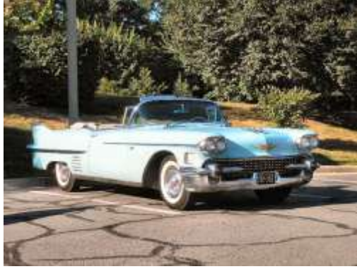
A few interesting examples include

Joe Pascale's '58 Cadillac convertible, a survivor Dodge A-100 van with a locally fabricated roof rack and side mounted surfboard rack. This van is on its way to a new owner in Hawaii.