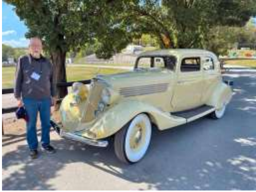
Photo of me in front of a 1934 Studebaker President 8 taken in Washington, PA at the All Studebaker Nationals.