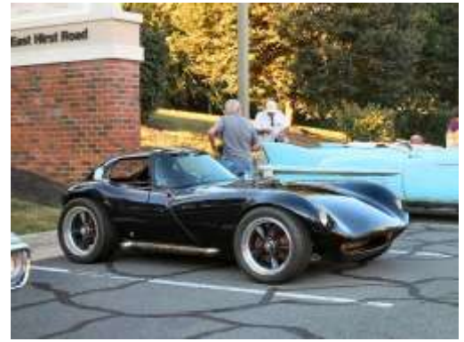
A Cheetah replica was also at the Aug. 30 cruise.