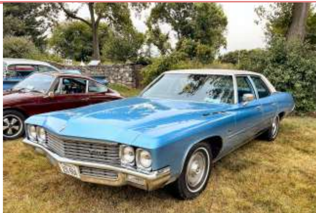
OCT CALENDAR CAR OF THE MONTH: Tom and Emily Parker's 1971 Buick. See story page 3.

We left White Post and headed down Route 11 to Strasburg for a very good lunch at Castiglia's Italian Restaurant. They were very accommodating and both the food