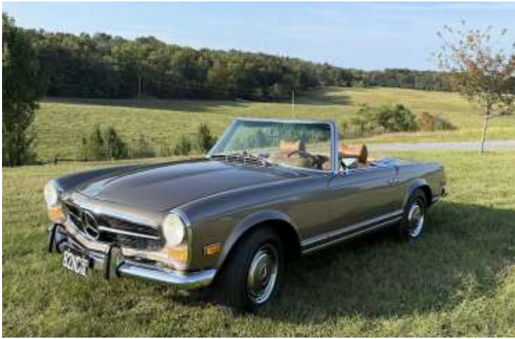
Kevin & Nicole Malony's 1969 Mercedes-Benz 280 SL