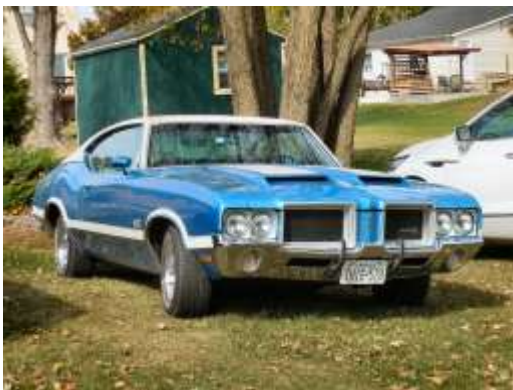
The blue '71 Olds 4-4-2 was in the spectator lot.