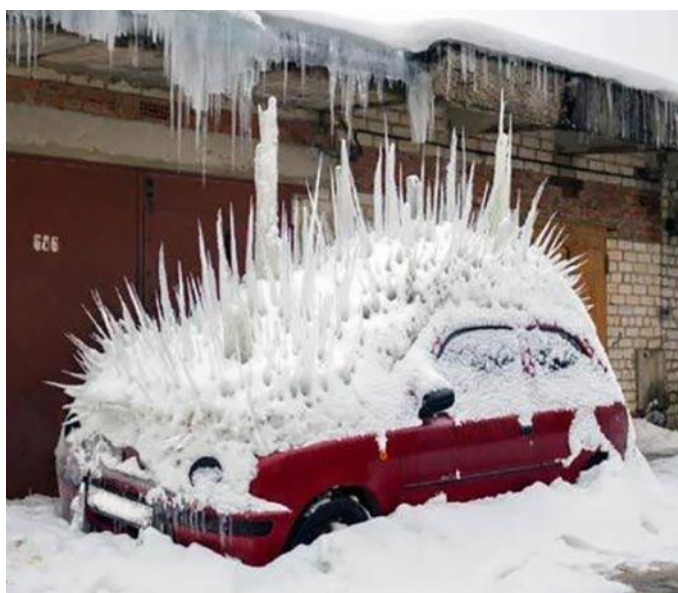
[So...apparently the Punk Rock look is not yet out of style...]