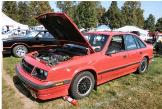
A late 70's or very early 80's Camaro.