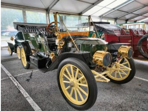
The dark red 37? Lincoln convertible almost dwarfed the 62 Imperial convertible parked next to it and seen in the reflection on the side of the bigger car.

On Monday, October 3rd, for work I had to take a vintage car to the auction at Hershey Lodge. The auction is held a couple miles away from the rest of the Fall Hershey events. After I unloaded, they allowed me a quick look at the cars that had arrived by that time, and I was allowed to take a few quick photos. I had to take a photo of the Stanley Steamer. A buddy of mine has been shopping for one. I'm sure this one was beyond his budget.