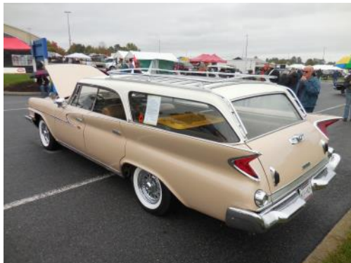
The non-running 57 Dodge Royal was in the vendor area. The price was

$16,000 and it had a very straight, solid body. Still, it needed a full restoration. The blue 50 Buick Roadmaster was the car Tom wanted to bring home, but there was no owner around and no price on the windshield. He did text a picture of it to his wife, just to test her reaction.