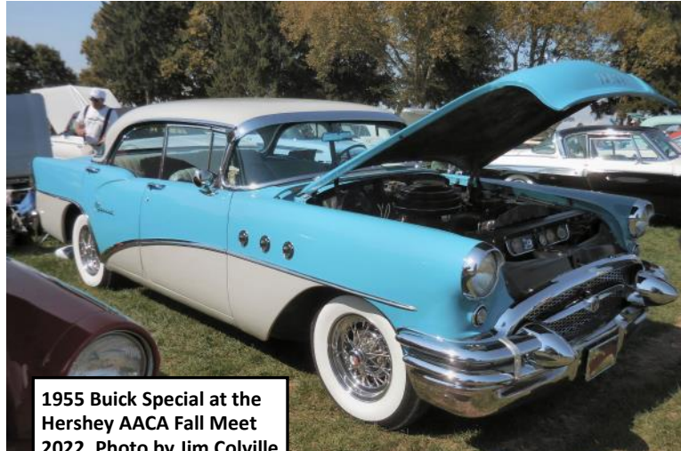
1955 Buick Special at the Hershey AACA Fall Meet 2022.