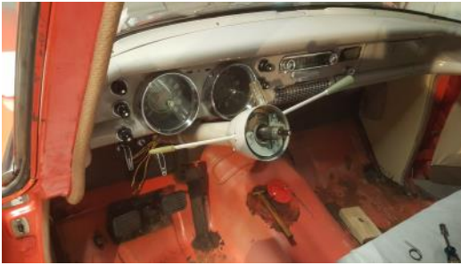
[View of dash. Steering wheel is removed for new shift linkage installation]

Over the course of the next several months, Craig pursued items to make the car more roadable, including new