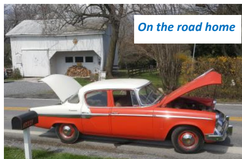
On the road home

After several visits to the car, Craig finally brought it home April 8, 2022, the day before our 40th wedding anni-