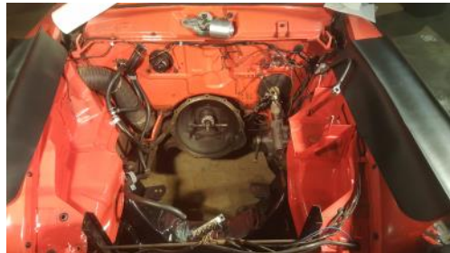
[Without the engine, Craig had access to spruce up under the hood]

Once apart, we took the engine and its many components to a machine shop in MD for work Craig doesn't