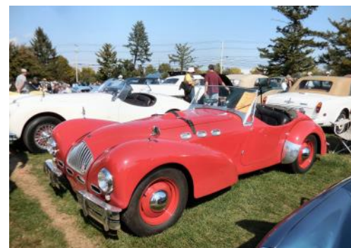
At top right, the last of the truly big tail fins were on the 61 Imperial. The yellow 1973 DeTomaso Pantera pictured below it was the only Pantera in the show, and was in the HPOF class.