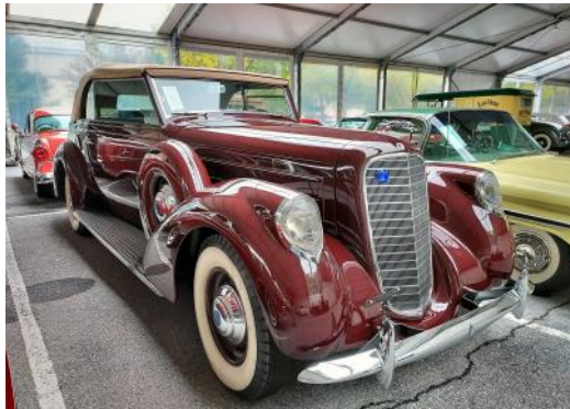
The 59 El Camino was unusual in yellow with green roof and tail fins.