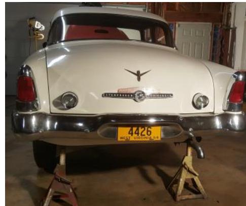
[Back up lights added to trunk lid]

wear issues on an engine: pistons, seals, gaskets, valves, springs, bearings, and all the rest.