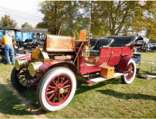
By contrast, a 1966 Chevelle, and an Audi Quatro.