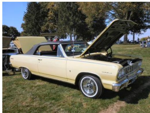
There were several Model A Fords, but not as many as you would see at the Sully Plantation Father's Day car show in Chantilly, Virginia. But then, that