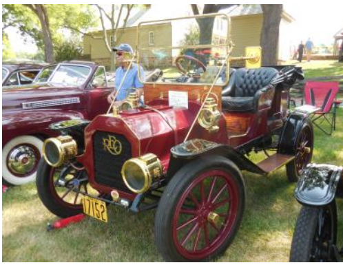
Packards from 30's 40's and 50's were all displayed in the show. A REO represented the early days of motoring.