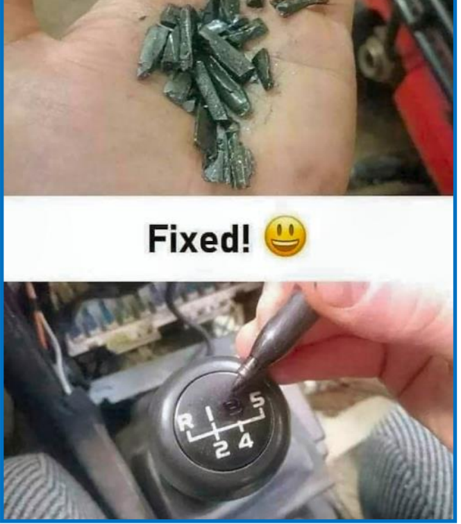
[Yeah, who needs that old 3rd gear, anyway?]