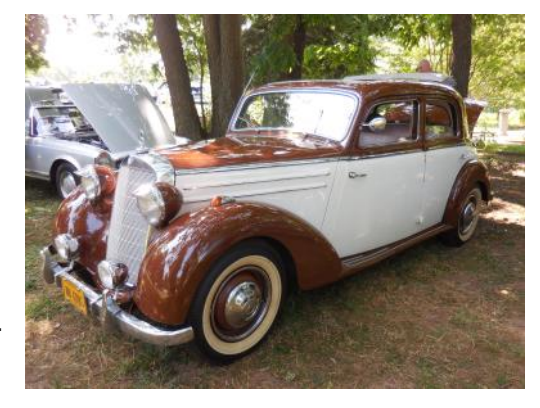
[Continued under MEMBER NEWS, page 11]