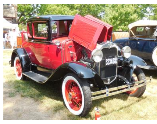
[Editor: Jim submitted over 150 pix of the Sully show. More will be shared in future newsletters. Thanks, Jim!]