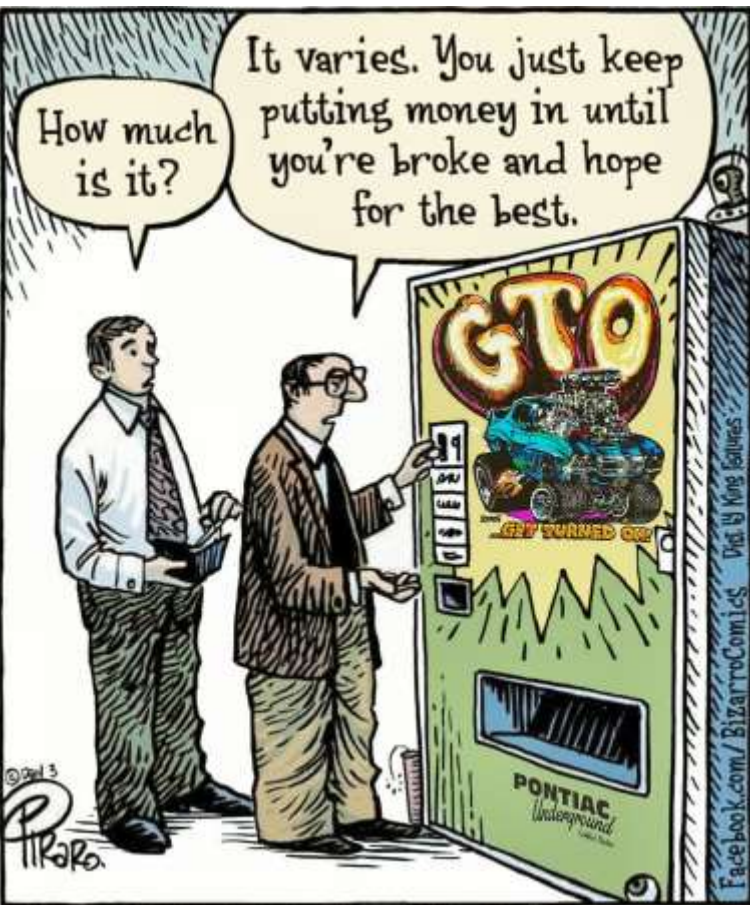
[These vending machines come in MANY different models...!]