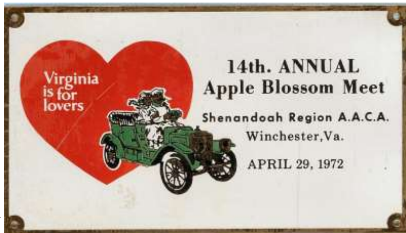
50 YEARS AGO THIS MONTH—OUR BRASS DASH PLAQUE