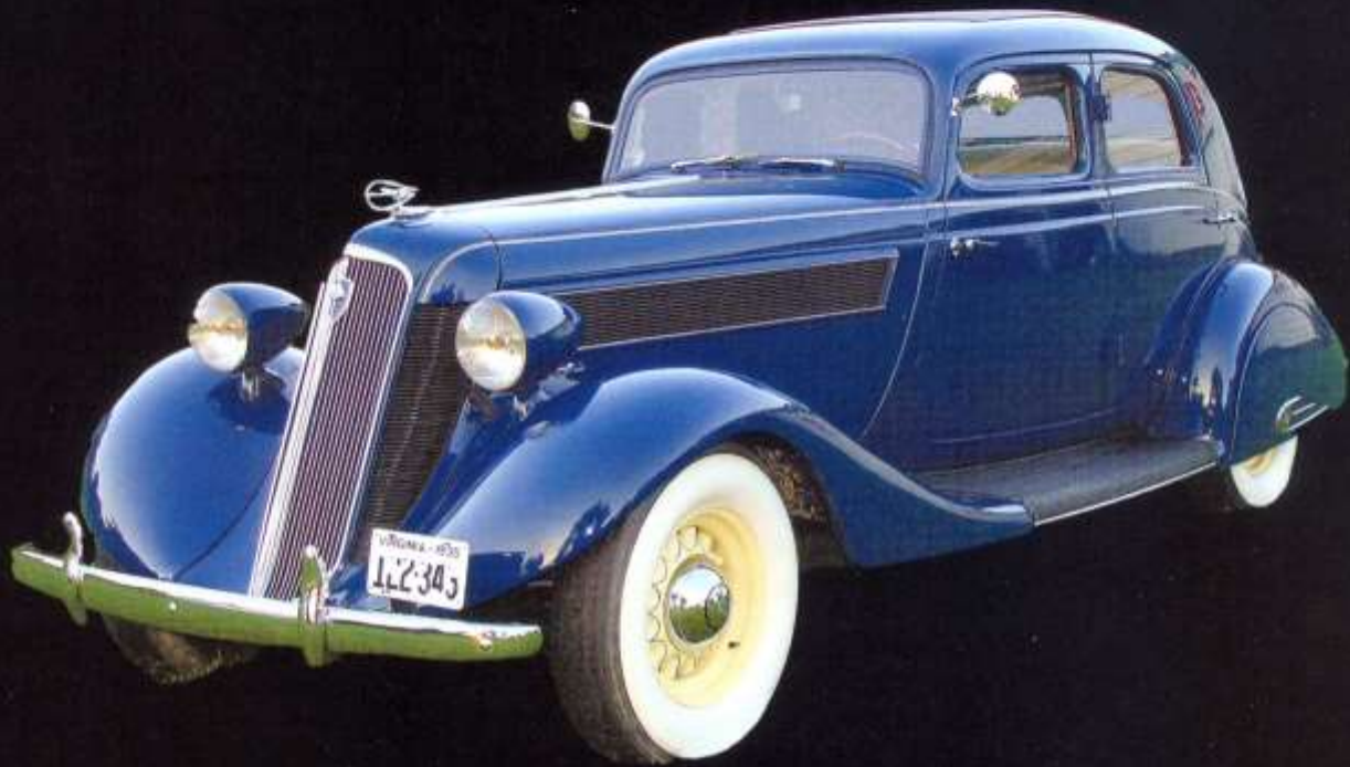
1935 Studebaker Commander Land Cruiser