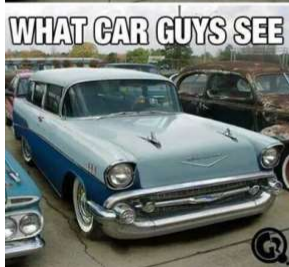
[Yeah, those car guys have big imaginations..... but maybe not the bank accounts to match 'em...]