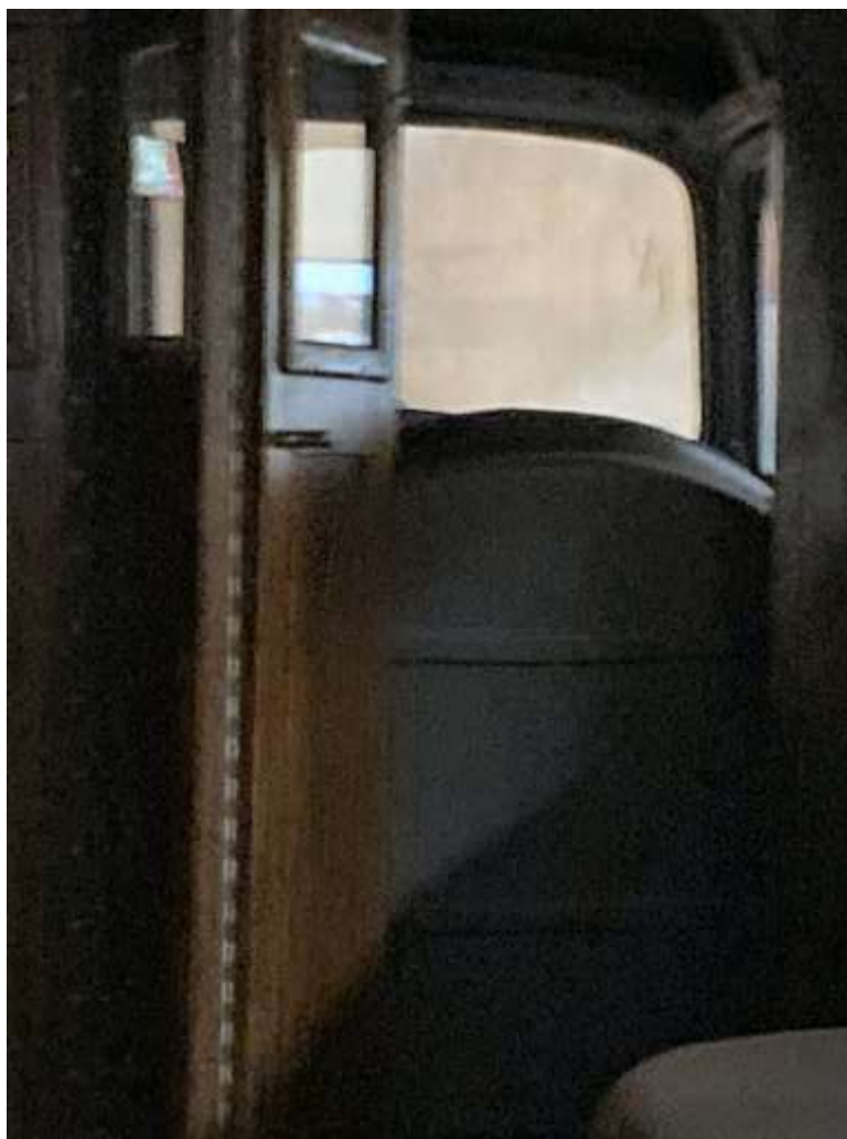
[Above: Note nifty bifold wooden doors between driver and gurney area]

[Editor's note: since the ambulance has no way to be moved at present—no rear end, remember? — Bill and Jim couldn't move it to get a good photo of the grille. Below is a photo from a 2015 Barrett-Jackson auction website showing another 1953 Chevy Suburban, to give readers a feel for what these trucks can do and a glimpse of a typical grille for the model. Jim's color scheme is a LOT more eye-catching, even without a canoe!]