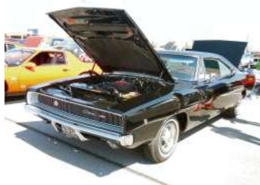
1968 Dodge Charger- Dickie and Sally Wolfe

Several region members attended with their cars and others were seen as spectators. Included are photos of cars belonging to the following members: