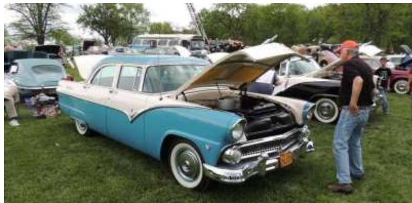
A Couple of Blasts from the Past! Apple Blossom Show Field Scenes 2014 and 2017