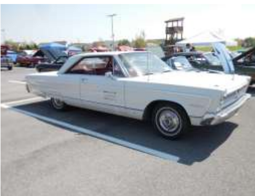
1966 Plymouth Sport Fury- Jim Colville