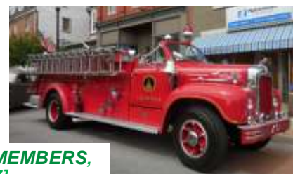
[see MEMBERS, page 7]