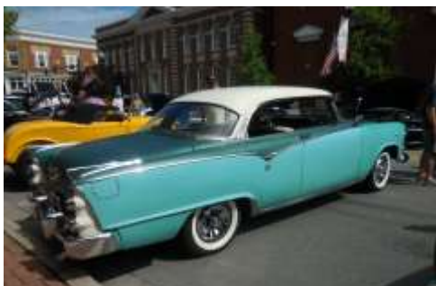
Ford convertible before. There was a

color, so those that survived are seldom seen in the once-popular metallic tan color.