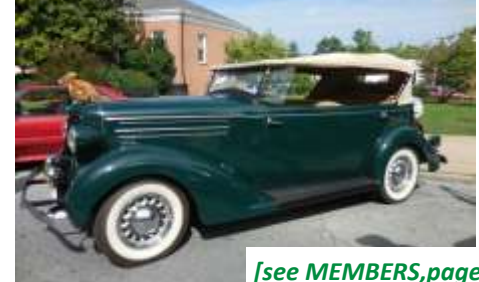
[see MEMBERS,page 11]