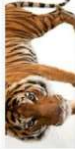
National Geographic Photo Ark

ITINERARY (continued): After our Saturday lunch stop, we'll make our way to our final stop, the notable Museum of the Shenandoah Valley. Located in Winchester, it has outdoor displays as well as its many indoor art, history and cultural exhibits. Featured in Oct. will be a loan from the National Geographic Photo Ark, with numerous compelling animal photos by Joel Sartore; and the Invitational Outdoor Sculpture Show, with works from seven local contemporary sculptors on display in the seven-acre formal gardens.