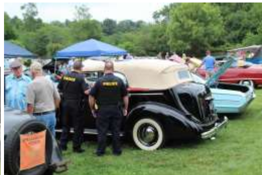
[Editor: "No, sir, Officer, Al Capone isn't hiding in the trunk of this 1937, honest !"]