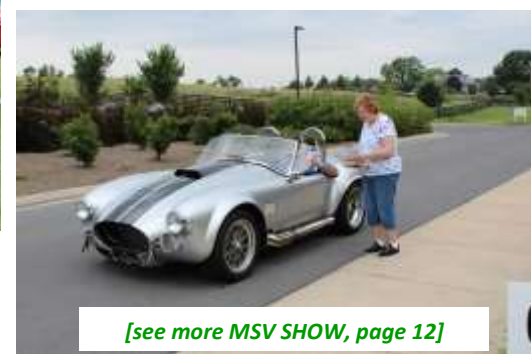
[see more MSV SHOW, page 12]