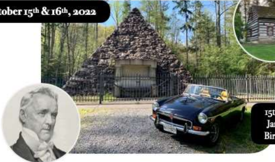
15th U.S. President James Buchanan's Birthplace & Cabin

Join us on our annual joint regional tour as we explore South-Central PA this fall. We will join regions in Williamsport, MD, at the Franklin collection of the Russell Family. Then head north to Gettysburg, PA for lunch and to tour the new WWII American Experience Museum of the Buck Family. Continuing north we will visit the Rolls-Royce Foundation Museum & Research Facility in Mechanicsburg, PA, where we will also be staying the night at the new Fairfield Inn & Suites. On Sunday we will drive south to the Strawmyer Family Corvette collection in Shippensburg, PA. We will then continue south to the birthplace of the 15th U.S. President James Buchanan and to the frontier town of Mercersburg, PA for lunch. On the way home we will pass Irwinton Mill & cross over a covered bridge. We conclude our jaunt at Wilson's 1847 County Store and Sweetsies' Ice Cream in Clear Spring, MD. This approximately 200 mile tour will traverse some beautiful rural farmland and visit several great car collections at the peak of foliage color.