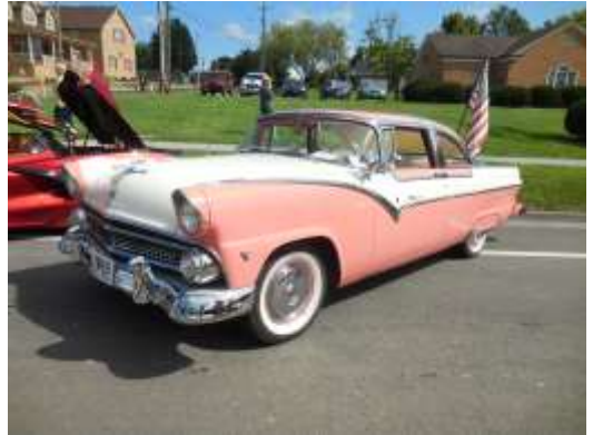
A chopped Olds that reminded me of the gangsters' car in the old "Wacky Races" cartoon,

55 Ford Crown Victoria (with a little added trim at the beltline borrowed from a 55 Mercury).