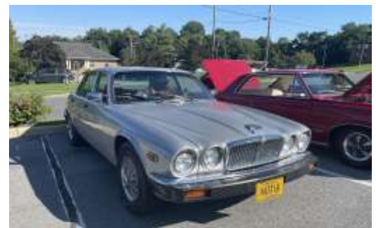
[More MEMBER NEWS, page 5]