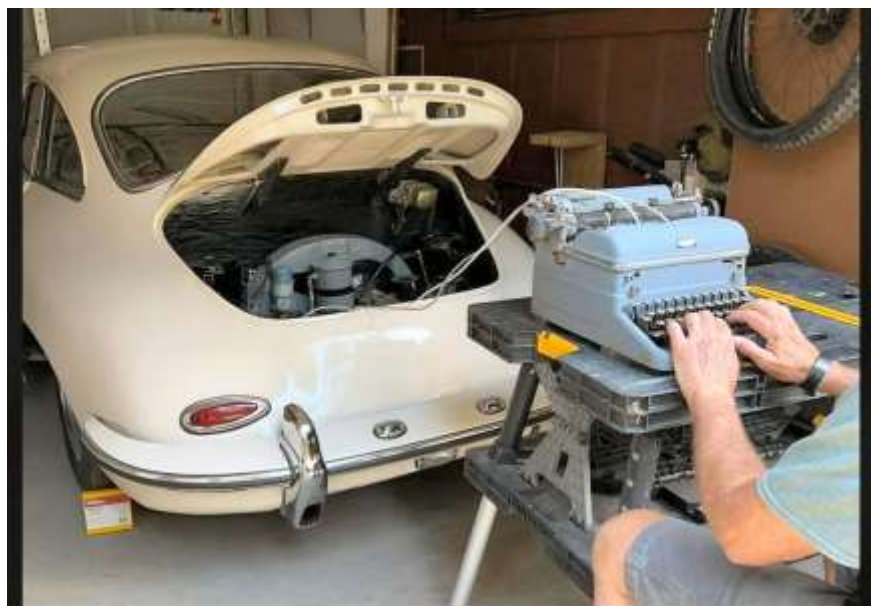
[Rare photo of an early engine diagnostic tool ....]

NOTE: STARTING IN OCTOBER OUR MEMBERSHIP MEETINGS WILL BE INDOORS AGAIN. SEE PAGE 5 FOR MORE INFO.