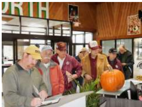
[Signing the guest book at the entrance]

of automotive eye candy. Here we were in a full-size regional shopping mall with every store packed with an incredible variety of vintage and even some modern iron. Most of which were for sale. I couldn't have ever imagined making a trip to a shopping mall and walking down every aisle in every store in the mall in a single visit. But that's exactly what we did. There was so much to see and so much walking.