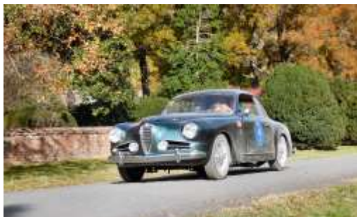
Bottom left, a newer model Alfa Romeo and top center, a '54 Alfa.

Many of the cars entered were Italian (modern Ferraris, vintage Alfa Romeos and even the '57 Lancia below). But since the Mille Miglia is an Italian event, the attraction for Italian car enthusiasts was no surprise.