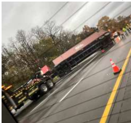
[View of scene from van's back window. ]