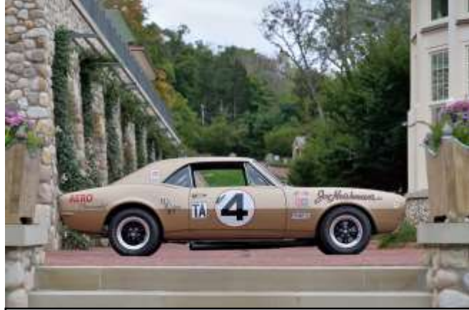
The First Z-28 Camaro Photo by Richard Truesdell from www.streetmuscle.com posting 06/06/2023

After finally coming up with the name Camaro, that loosely translates into "comrade" in colloquial French, Chevrolet cleverly decided to link it with racing and performance, even though racing was banned by the big three auto makers after the 1955 Le Mans disaster when 80 spectators were killed by