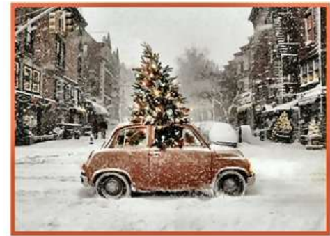
Shenandoah Region Antique Automobile Club of America

Our annual Christmas party was held at West Oaks Event Venue in Winchester. We had a nice turnout - a total of 44 signed up, so we nearly filled 6 tables of 8 seats each. There was plenty to eat (we even got boxes to take home leftovers), and a lot of "motor-metering" going on, especially during the social hour before the buffet.