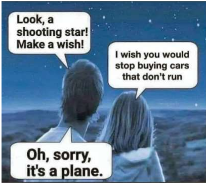
[Oh, darn, I guess it doesn't count...Hey, wait a minute !]

Driving Directions to Round Hill Church 2993 Northwestern Pike, Winchester, VA 22603 Starting just west of Winchester Medical Center, from the intersection of Route 37 and Route 50: • Drive west on Route 50 (Northwestern Pike) for approximately 2 miles. • Shortly after crossing Nat'l Lutheran Boulevard, turn left on Route 654 (Poorhouse Road). There is a used car lot on the left as a landmark. • At 0.2 miles, turn right onto Route 803 (Round Hill Road). Winchester Independent School across the road is a landmark at this intersection. • At 0.3 miles, turn right at the Church rear driveway (Trinity Lane) and uphill into the parking lot. There is a sign at the driveway entrance. Fellowship Hall entry is at the bottom level, rear of the Church, off the parking lot. No stairs to climb.