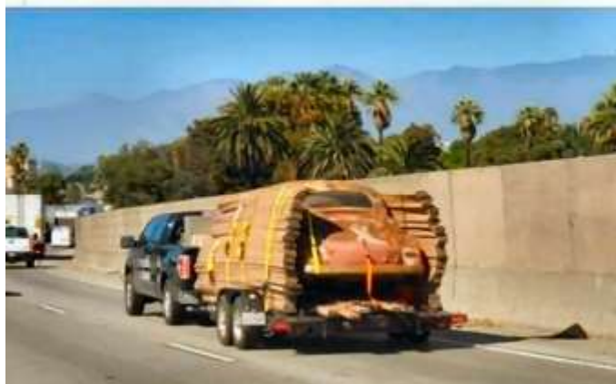
From Facebook—Car Memes & Jokes Page

Here's a guy sneaking his next project home without the wife knowing