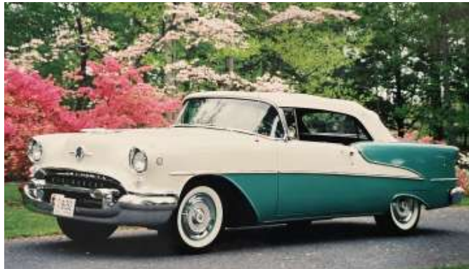
APR. CALENDAR CAR OF THE MONTH: Art Bragg's 1955 Oldsmobile (see pg 3)

Hopefully spring is right around the corner, and we'll be enjoying these longer days with warmer temperatures. It hasn't been a "bad" winter just a rough one at times with the snow, ice and lengthy sub-freezing days we had to put up with. I'm banking on that type of weather to be behind us and looking forward to much warmer temperatures!! We have had some very mild and warm days sneak in recently which were very much enjoyed but they were too short lived. Some of you have already been out tinkering in a nice, heated garage and those of us less fortunate will soon be able to get out there