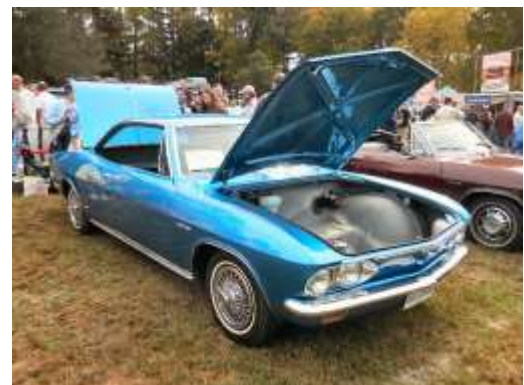
The red second generation Toyota Celica Supra was the cleanest one I've seen since the '80s. Might be the only one I've seen since then. The blue Corvair was one of three in the show.