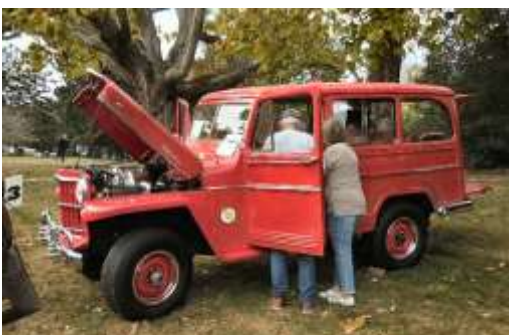
In the 4-wheel drive section, vintage Land Rovers (like the green short

wheel base model) outnumbered the vintage Jeeps. My favorite of the Jeeps was the red Jeep station wagon.