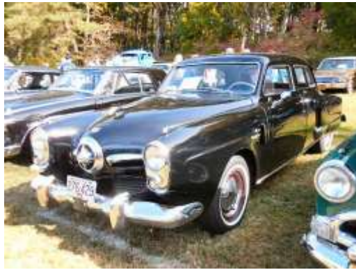
Among the Studebakers was this 1950 Land Cruiser.