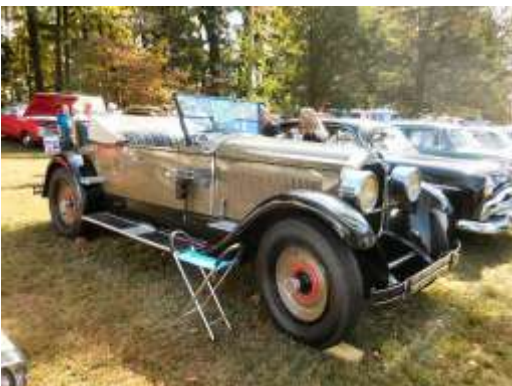
Among the Packards in the show were this early '50s Patrician, and the oldest Packard, a convertible coupe dating from the late '20s.