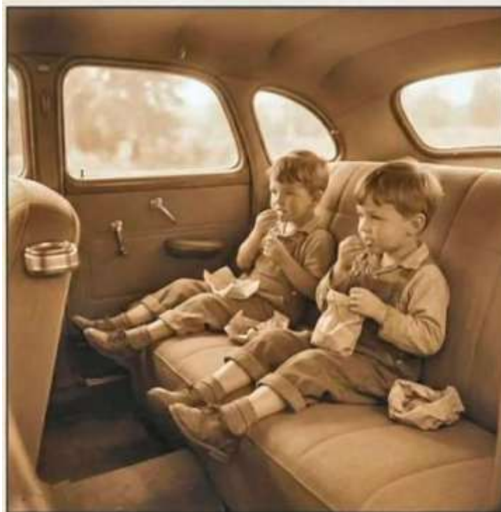
From Facebook - 'The Funny Pages' Page

We didn't need seat belts—we just got tossed around like laundry and held on to the ashtray.