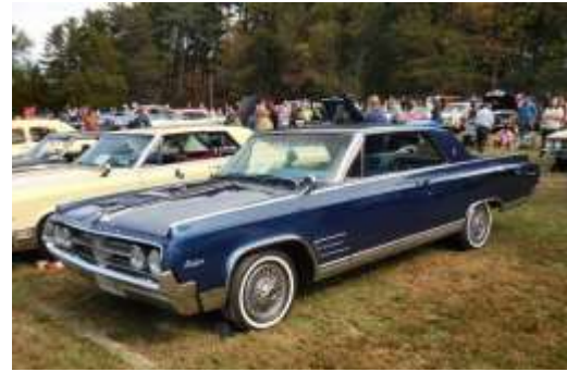
Oldsmobiles are always well represented. One of my favorite Oldsmobiles has always been the '64 Starfire. It was amazing to see two '64 Starfires together. That probably only ever happens at the largest of Oldsmobile shows. Between the yellow '64 and the dark blue '64, I think I would have to pick the yellow one.