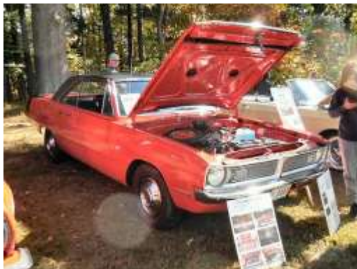
The red '70 Dart Swinger 340 4-speed may have been the most perfectly restored Mopar in the show.