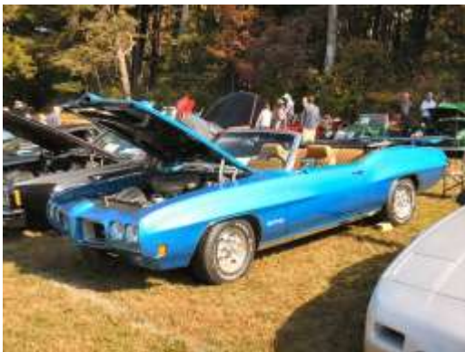
There seemed to be fewer Pontiacs this year than last. The yellow '67 Firebird was nice, but of the several GTOs in the show, the blue '70 convertible was nicest.