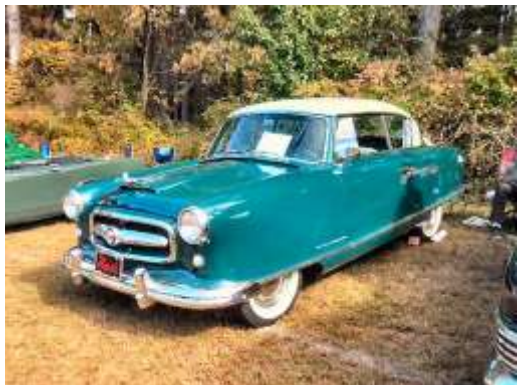
The first-generation Dodge Viper was the newest Chrysler product in the show. Next, a 1953 Nash Rambler Country Club.