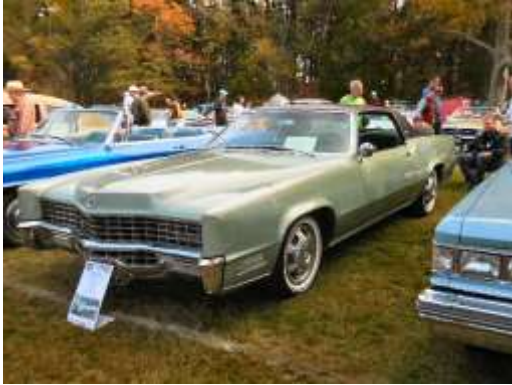
Cadillacs were another marque that showed up in large numbers. Here, a bright red '57 El Dorado convertible. Ten years later, the El Dorado would look like the green coupe in the next photo.