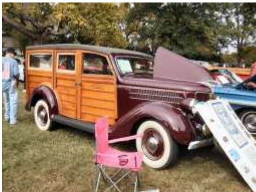
The '36 Ford 'woody' wagon was beautiful. Of the DeSotos, the blue and white '55 looked the most appealing as it was a two-door hardtop.